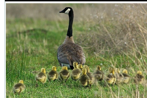
"Gander 9 er and the gaggle off to Mali"

Captions will be judged on a basis of hilarity, suitability, operational relevance, 408 history, team-building and punniness.